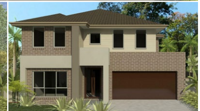
Bayview Aspire with Corner Facade