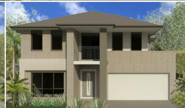
Bayview Aspire with Balcony