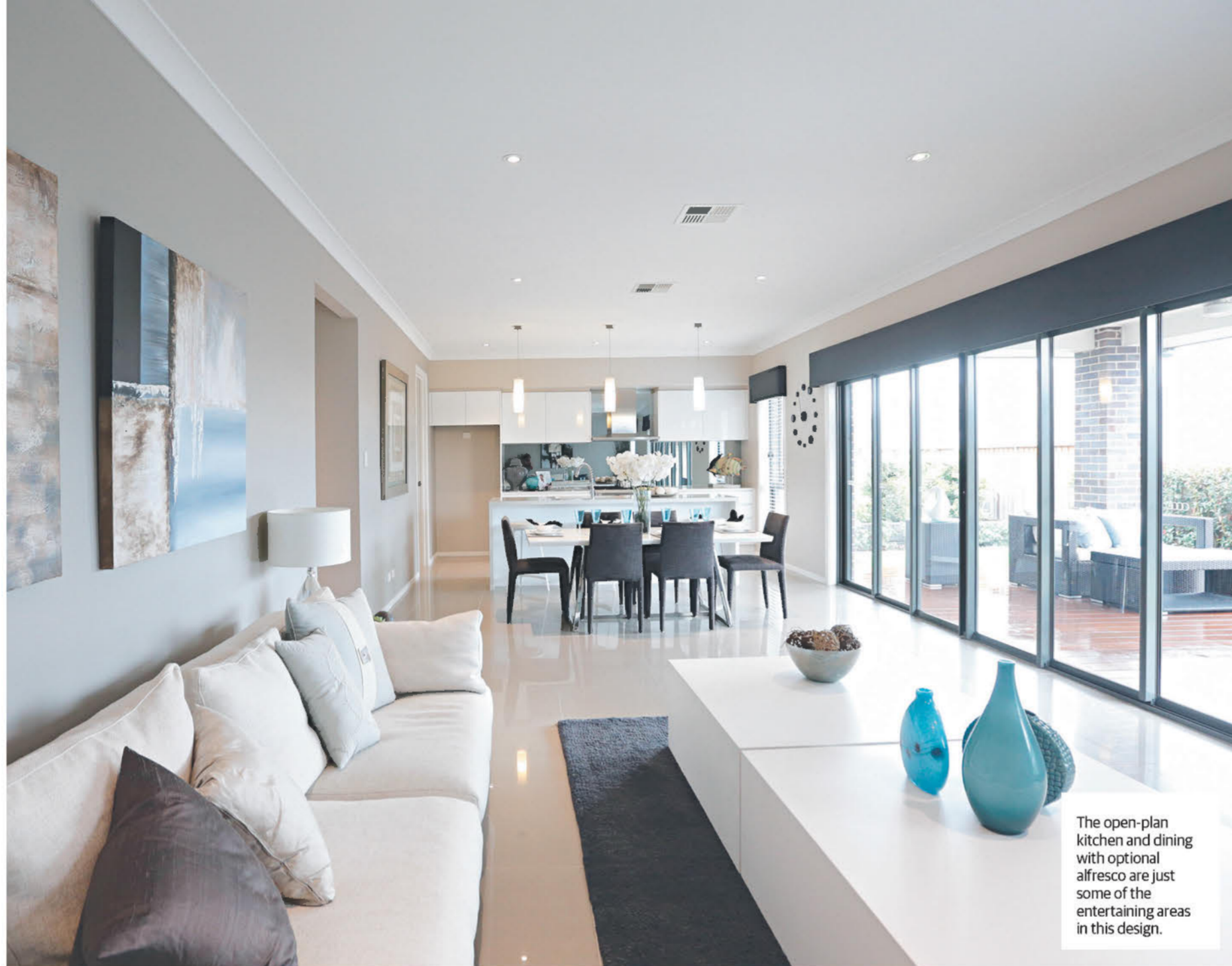
The open-plan kitchen and dining with optional alfresco are just some of the entertaining areas in this design.