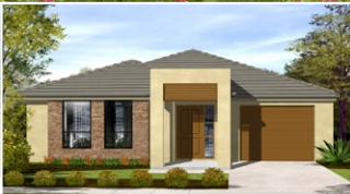
Bellaire - Facade

Home Package Price From $231,800 on your selected lot