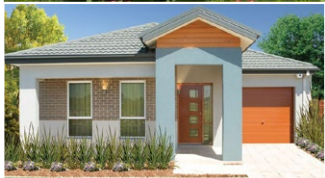
Metro - Facade