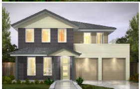
Metro - Facade

Home Package Price From $309,000 on your selected lot