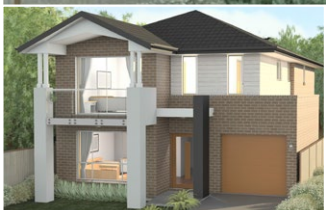
Elite - Facade

Home Package Price From $272,800 on your selected lot